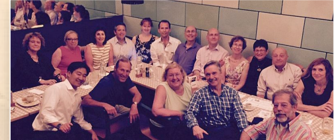
European Society of Ophthalmology Congress 2015 Vienna