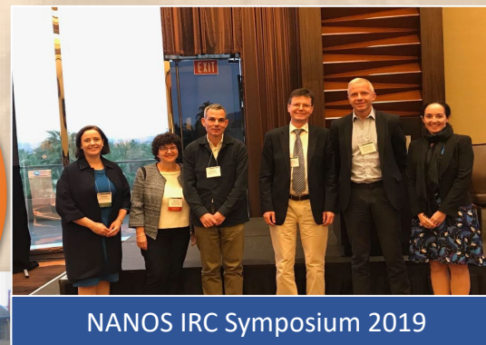
NANOS IRC Symposium 2019