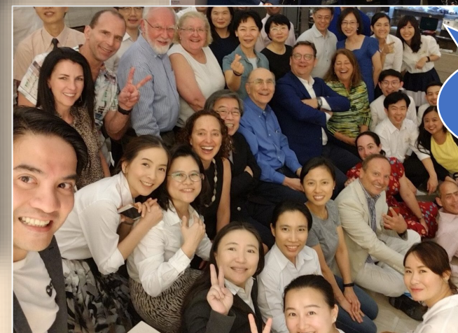
Asia Pacific Academy of Ophthalmology Congress 2019 Bangkok