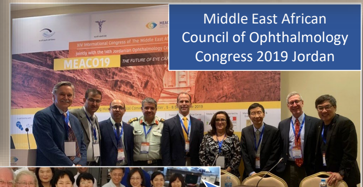
Middle East African Council of Ophthalmology Congress 2019 Jordan