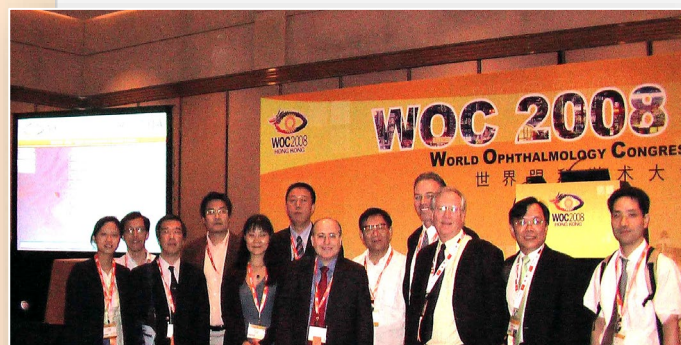
World Ophthalmology Congress 2008 Hong Kong