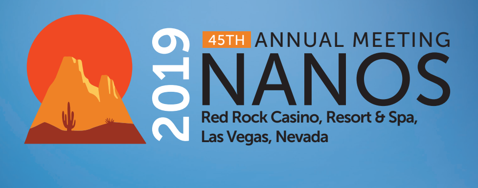
EXHIBIT & SUPPORT PROSPECTUS