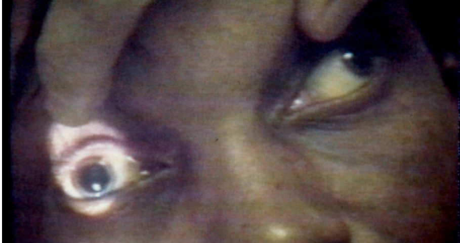
III rd Nerve Damage With Pupil Enlargement

Pupil enlargement in addition to lid droop and eye muscle weakness may signal an aneurysm and is a medical emergency. The patient should immediately have neuro-imaging (CT, MRI, MRA, and/or angiogram) to look for the aneurysm.