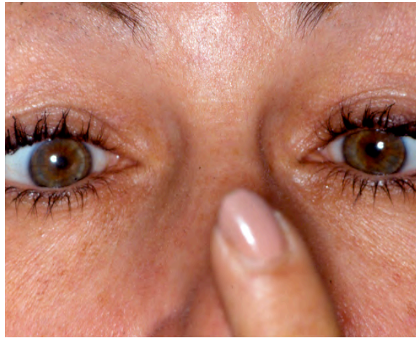
Recovered Ability to Focus Up Close