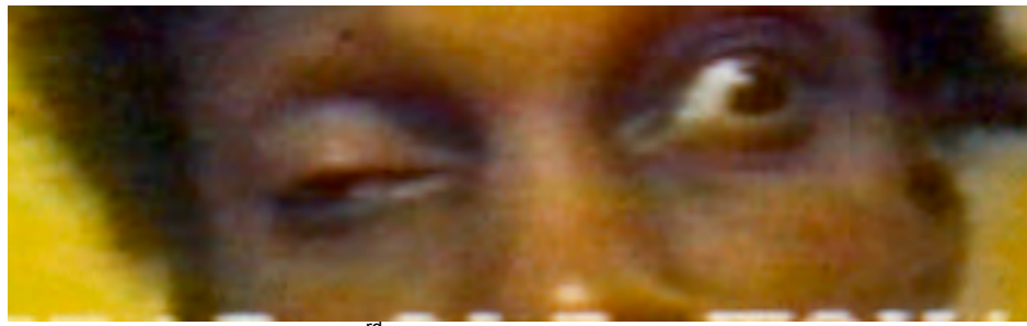
III<sup>rd</sup> Nerve Damage – lid droop

The nerve that goes to the constrictor muscle is part of the III<sup>rd</sup> cranial (oculomotor) nerve. The III<sup>rd</sup> cranial nerve controls several of the muscles that move the eye. It also controls the muscle that opens the eyelid and the muscle that constricts the pupil. A problem with the III<sup>rd</sup> nerve can result in a droopy eyelid, double vision and/or enlarged pupil.