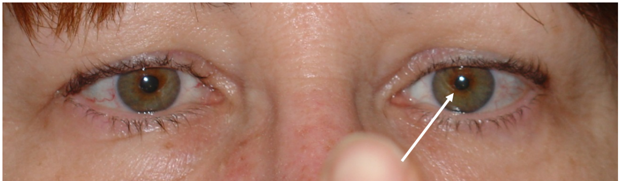
Left Adie tonic pupil. When focusing on the finger up close, the left pupil constricts more strongly (arrow).